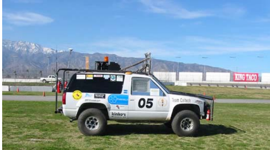
Figure 3: Team Caltech's DARPA Grand Challenge entry. This photo was taken at the Qualification, Inspection, and Demonstration test the week before the race.

effective and creative ways to integrate the teaching of control theory and applications.