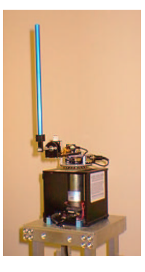
Figure 2: Experimental apparatus.

gives local exponential stability. Figure 3 shows a comparison of experimental and simulated results for these control parameters. The solid curve shows experimental data while the dashed curve shows simulated data with an initial condition determined from the data. At time zero, the pendulum is very near the feedback-stabilized inverted equilibrium. At approximately 2 seconds, the pendulum is perturbed. The system undergoes a damped oscillation, converging once again to near-equilibrium within about 2 seconds.